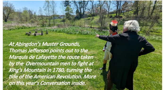
At Abingdon's Muster Grounds, Thomas Jefferson points out to the Marquis de Lafayette the route taken by the Overmountain men to fight at King's Mountain in 1780, turning the tide of the American Revolution. More on this year's Conversation inside.