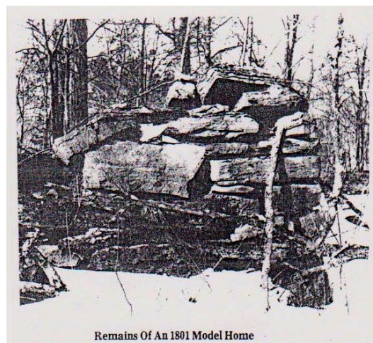
Remains Of An 1801 Model Home