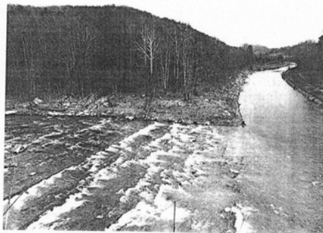
The Riverside Site Of The Envisioned Town

Located at the junction of the South Fork and Middle Fork of the Holston River (in a flood plain, no doubt), it isn't hard to imagine a site of intense beauty. Neely cleared the land of its thick stands of pine, oak, and poplar, graded roads, and marked each lot's corners with piles of stones. And, he quickly sold all but 3 lots at prices ranging from $10 to $25.00.