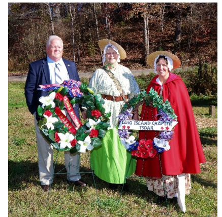
Representatives from Sons and Daughters of the American Revolution brought wreaths