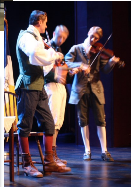
Sons of Liberty on stage