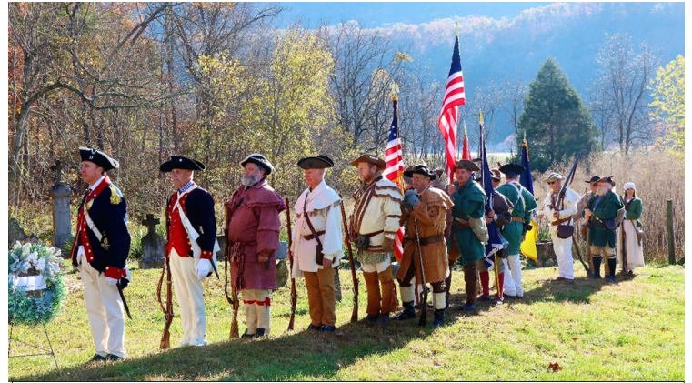
Joint Virginia and Tennessee Sons of the American Revolution Color Guard