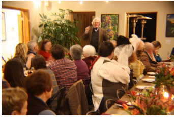
Dinner at Abingdon Vineyard Dinner at Abingdon Vineyard