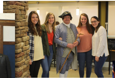
At Emory & Henry College and Patrick Henry High School