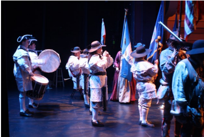
SAR Color Guard and Muster Ground Musick