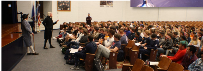
At Abingdon High School